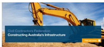
Profile of Civil Contractors Federation

Whether you are into machines or technology, building bridges, working in the office or in the bush – the options are endless. If you are interested in a career with a manufacturer or supplier of construction and mining equipment visit http://www.cmeig.com.au/careers.htm